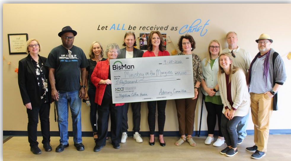
Above: BisMan Community Foundation committee members and staff at Ministry on the Margins at the grant award ceremony on September 28, 2022.